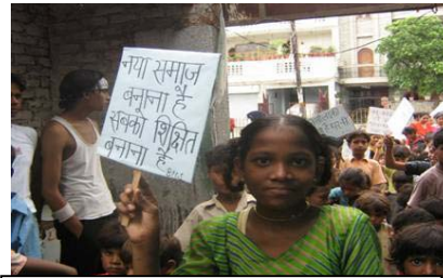
GIRLS IN THE COMMUNITY RALLY

slogans and distributed the pamphlets specially designed for the drive.