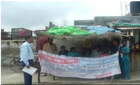
ADMISSION DRIVE CAMP-HOLAMBIKALAN

c) Two 'Admission Drive' camps were held at each NGO site, either inside or near the government schools in the areas for facilitating and helping the parents through the admission process.