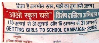
BANNER OF THE DRIVE

Admission Campaign and Enrollment drive is an innovative approach towards mobilizing the